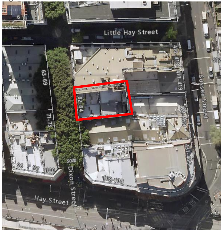
Figure 1: Site of 82-84 Dixon Street

The site contains a three-storey brick building in the Edwardian style, divided into two terrace-style tenancies, numbered 82 to north and 84 to south. The building was constructed in 1910. External photographs are included at Figure 2.